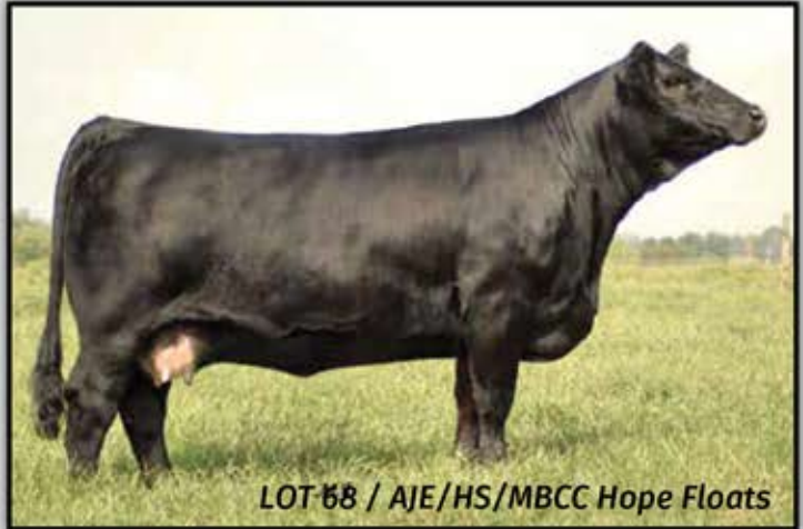
LOT 68 / AJE/HS/MBCC Hope Floats