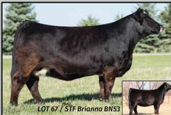
LOT 67 / STF Brianna BN53