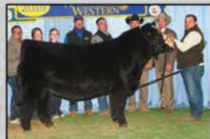
TJSC King of Diamonds - Full Sib

Here is one that has as much power and structural integrity that you could ask for, as well as an awesome look. The story behind this pedigree is one that is successful and just beginning. Last year we sold a full sister to Diamond 232F for 25k to Iowa and just recently a crowd favorite in Denver, TJSC King Of Diamonds 165E, was named Reserve Simmental Bull at the NWSS. With the cow power on the bottom side of this bull's pedigree, you can't go wrong.