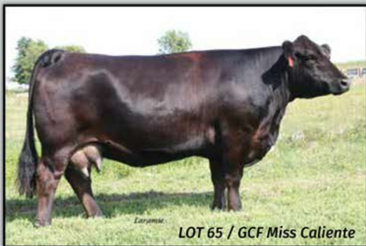
LOT 65 / GCF Miss Caliente

Caliente is highly proven just read the footnote below on her most famous daughter Onyx. The mating to the three time champion Copacetic will only be special. The other mating is to Double Down the outstanding young bull we own with Hicks Cattle Co., High Prairie Genetics and Werning Cattle Co. Both sets of embryos are IVF unsorted embryos.