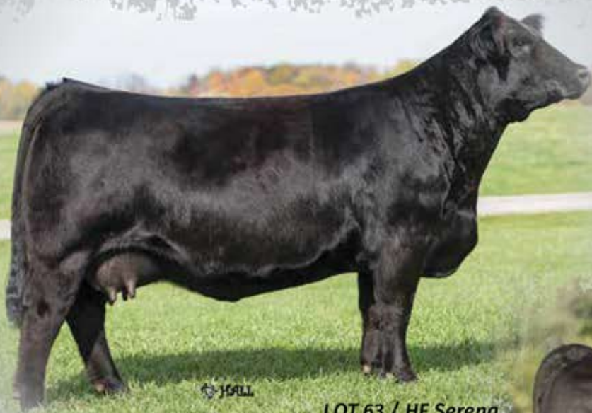
LOT 63 / HF Serena