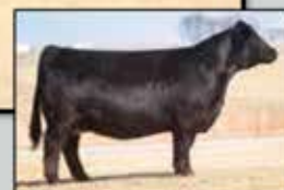
JS Flatout Flirty 46T - Dam