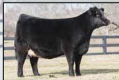
R&amp;C LB Blackcap Gal - Dam