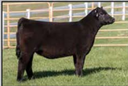
Lot 111 / 41Y Salute Daughter