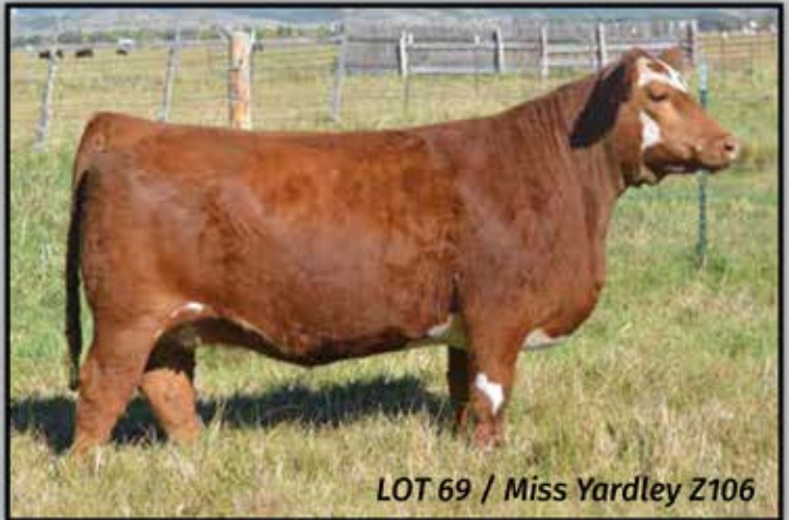
LOT 69 / Miss Yardley Z106

Selling 3 embryos, guaranteeing 1 pregnancy We recently selected this powerful red donor out of the Spring Turnout sale from Sloup Simmentals as the top selling pair. The red donor is somewhat is an outcross to many bulls today and has loads of breeding opportunities. Miss Yardley being open with a calf at side we decided to flush prior to making her home in Ohio. So we hit a home and flushed to W/C Loaded Up 90D. We are able to share genetics and benefit the Sweepstakes. Call for any details on this awesome red individual.