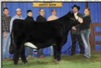
TJSC Cinderella 595Z - Dam