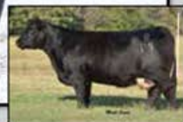
GCC Sioux Miss 8/19U - Dam