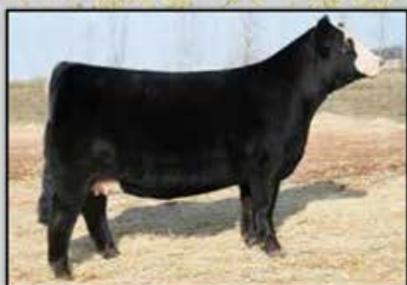
TJSC So Sweet 104X / Lot 2 Dam