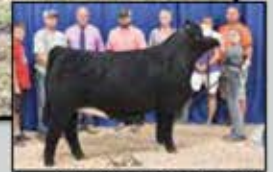
JPLF Miss Matlock - Dam