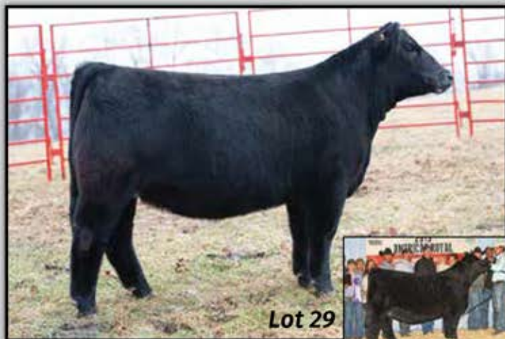
JS Black Satin 9B - Dam

What a striking female! CLAC Black Satin 408F is by LLSF Uprising Z925 and out of the famous JS Black Satin 9B, aka "Boots", who is a Triple Crown winning simmental female. A maternal sister to 408F sold in the 2018 Diva's and Donor's sale for $32,000. Another maternal sister sold in the Griswold Cattle Classic Sale for a valuation of $155,000.00!! Get in on the ACTION!