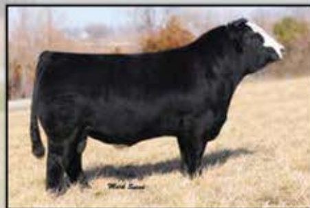
FBF1 Combustible / Lot 1 Sire