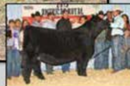
JS Black Satin 9B - Dam