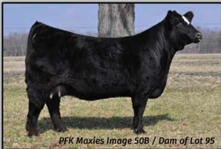
PFK Maxies Image 50B / Dam of Lot 95

Here is an athletic, powerful, moderate bull who is our first calf out of RHFS Miss Legend's Grace. Grace was our selection as the top lot at the 2017 Buckeye's Finest Sale. His granddam, RHFS Miss Legend Y78H, has been a feature donor for Rolling Hills Farms and Sloup Simmentals. Ranger is an easy keeper who also was a class winner at the 2018 Ohio State Fair.