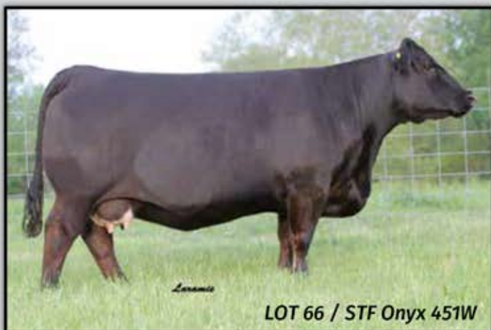
LOT 66 / STF Onyx 451W

It is fitting to offer embryos out of the one of the breeds best at the best spring expo, the Eastern Spring sale at the Ohio Beef Expo. Onyx was viewed as a two time North American champion however today we feel at Sloup Simmentals she rest on her production record. We never walk much in the show ring however we are proud of our customers that do take our genetics and show at a high level. We know it takes alot hard work, dedication and preparation and we are just happy to be a small part of the over the process. Pays the Price mixed with Onyx will earn some purple and make some green as well.