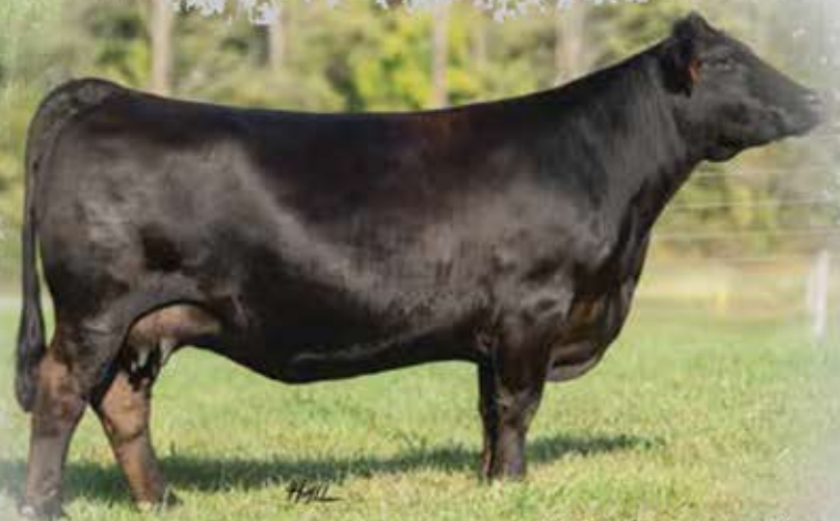
LOT 64 / HF Serenity