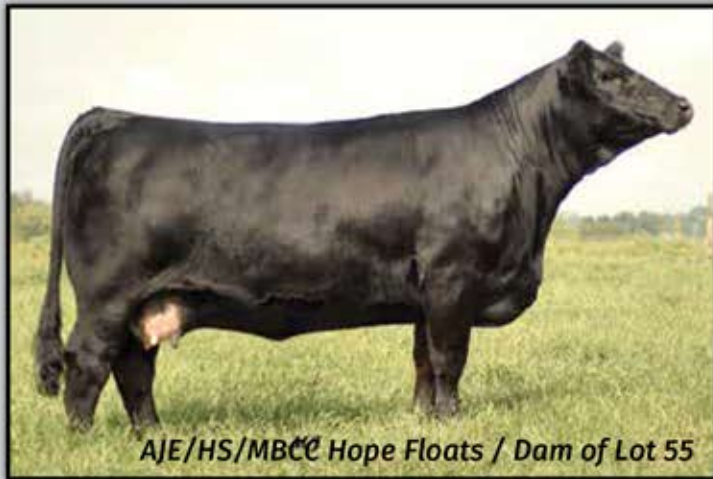
AJE/HS/MBC Hope Floats / Dam of Lot 55