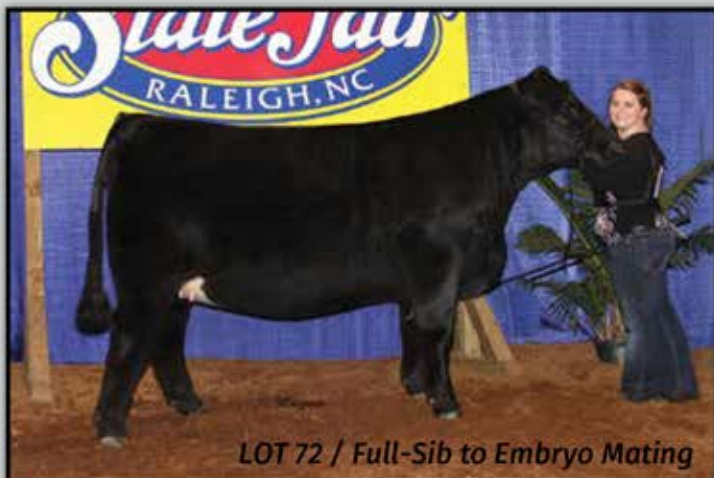
LOT 72 / Full-Sib to Embryo Mating

These embryos will be full sibs to the 2015 North Carolina State Fair Champion % Simmental, who also captured Champion % Simmental at the 2014 Winter Classic. These calves have a lot of grow and the look needed for the show ring we all desire. Miss Anne flushes well to allow us to share the good stuff. Don't miss out on this opportunity.