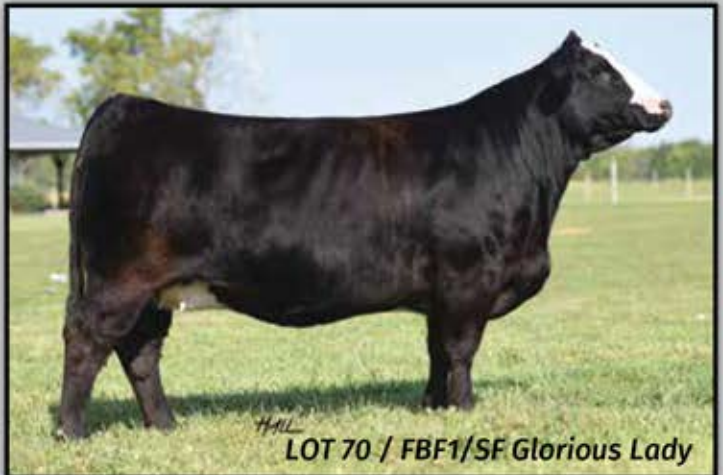
LOT 70 / FBF1/SF Glorious Lady

Selling 3 embryos, guaranteeing 1 pregnancy As soon as we bought in on Hammer Time we couldn't wait to cross him with A812 and several other of our donors. A812 is our full sister to Ignition that was top seller in the 2013 North American Select Sale. Since then she has produced top selling females and bulls alike for us and we still feel like we are just tapping into her potential.