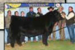
TJSC King of Diamonds - Full Sib