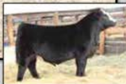
HILB/SHER Data Breach Service Sire