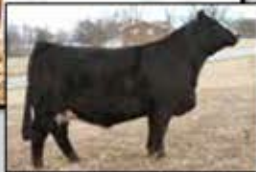
EBS Ebony Mavis - Dam