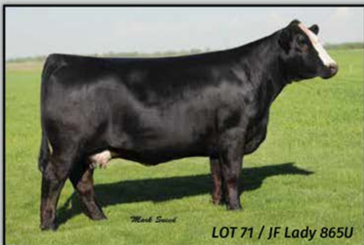
LOT 71 / JF Lady 865U

Here is some genetics you will want to consider on sale day. The JF Lady 865U is a donor that always has been popular because of her really good look and overall complete design. However the best factor is that she has the ability to pass this along to her progeny. A daughter sold for $30,000 and two breds sold in the Right By Design sale by Loaded up and Blaze of Glory. One set of three embryos are IVF reverse sort and sired by the many time champion, Womack. The second set are sired by the high selling Jack Around the outstanding son of Serena. The combination of genetics and blend will only be rewarding and profitable. The Womack eggs are IVF reverse sort and the Jack Around are conventional. Selling three embryos or just take all six. All sell with the proper guarantees.