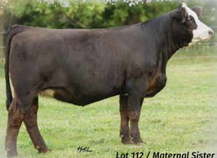
Lot 112 / Maternal Sister